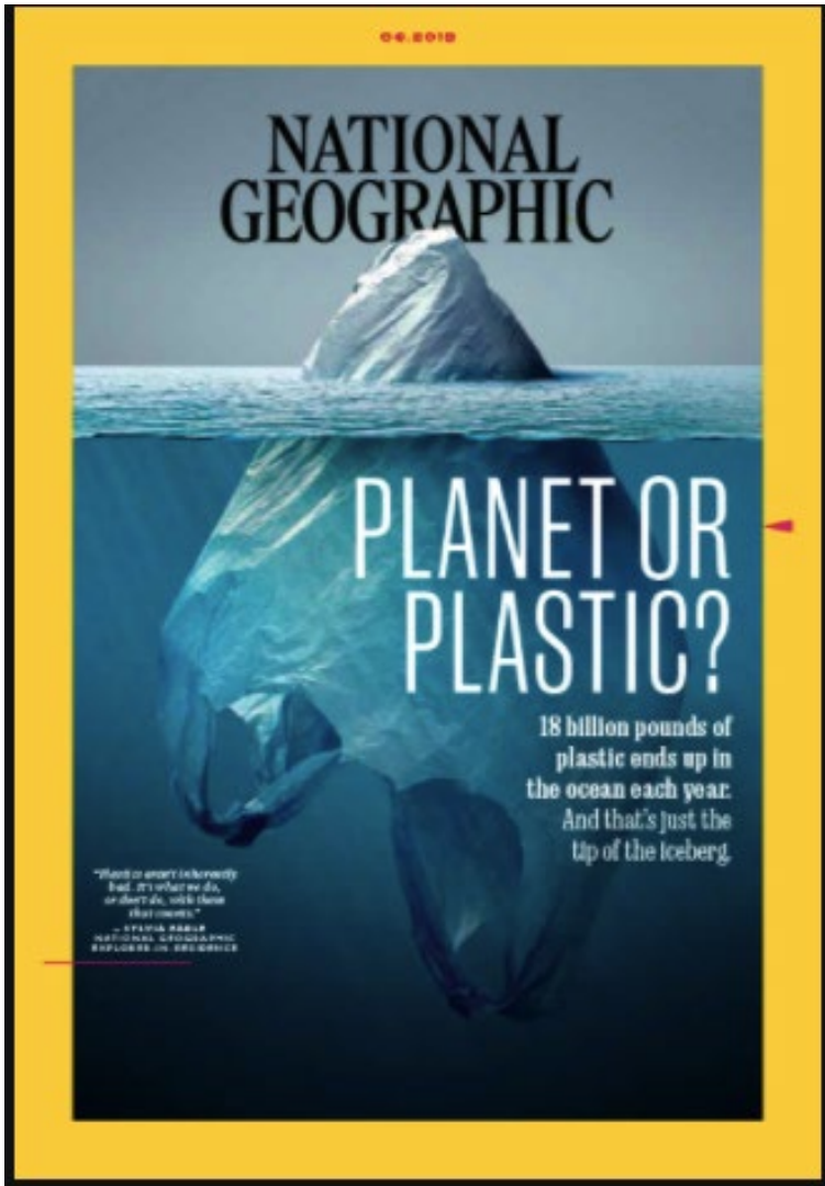
National Geographic / May 2018